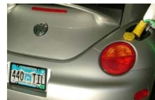
PV Bug, Namaste Solar

At the conference later that morning, I looked up and saw the driver at an exhibit, so I introduced myself. Turns out we had a lot in common--an interest in renewable energy--besides the same license plate. Thanks to the Colorado Carbon Fund and my great license plate, I have a new friend and business connection.